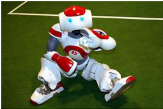
(a) real robot

The Nao humanoid robot manufactured by Aldebaran Robotics. This is the robot currently used in the competitions of the 3D Soccer Simulation League at RoboCup. Its height is about 57cm and its weight is around 4.5kg . Its biped architecture with 22 degrees of freedom allows Nao to have great mobility. The rcssserver3D can simulate the Nao robot nicely, see Figure 8.5.